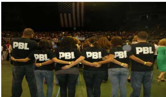
PBL members are shown wearing the trademark PBL Kendall Chapter t-shirt.

Phi Beta Lambda students from Kendall Campus were interviewed by Miami Herald Reporter Nirva Shah on March 4th regarding their view of the current stock market. The full story can be found at: http://www.miamiherald.com/103/story/933177.html .