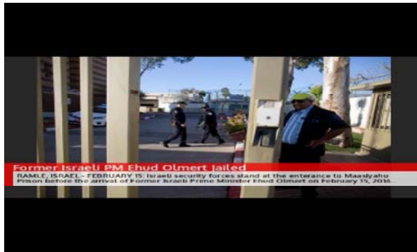
Former Israeli PM Ehud Olmert Jailed