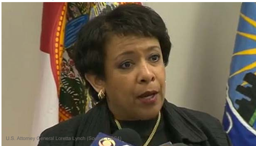
U.S. Attorney General Loretta Lynch

Filed Under: Loretta Lynch, U.S. Attorney General, US Attorney