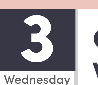
GAME DAY WITH CAB (3)