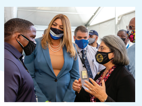
Visited MDC North Campus Mass Vaccination Site

Introduced Rapid Credentials and Digital Badges for In-Demand Tech Programs